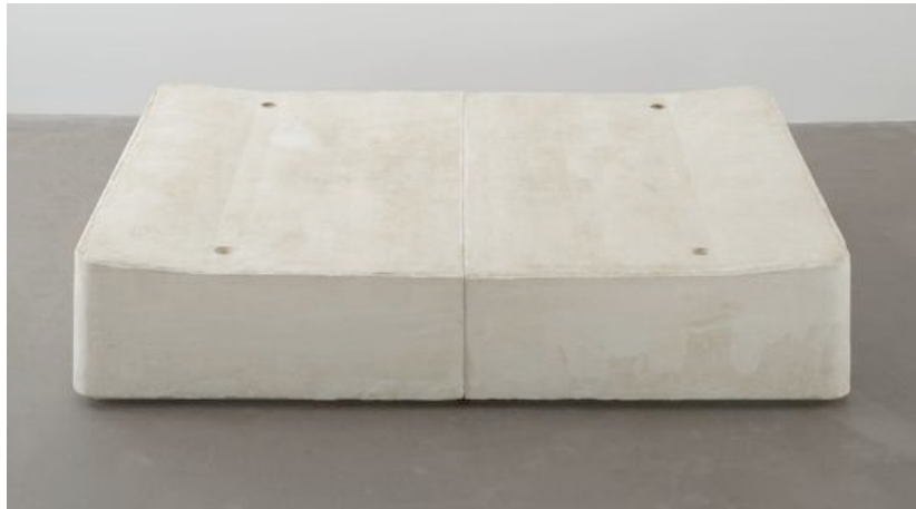
Rachel Whiteread. (British, born 1963). Untitled (Mattress). 1991. Plaster, 12" x 6' 2" x 54" Gift of Agnes Gund. © 2009 Rachel Whiteread